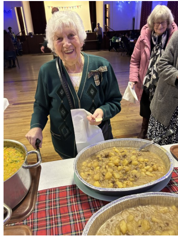
The Burns Afternoon Tea raised the healthy sum of £350 for the Restoration Fund.

https://www.sciaf.org.uk/get-involved/appeals/579-israeli-palestinian-emergency-appeal