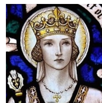
St Margaret of Scotland