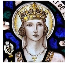
St Margaret of Scotland