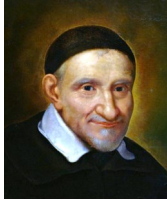
St Vincent De Paul

Dear Lord, thank you for providing for the needs of the parish, please keep us focused on your real treasure living amongst us: the poor.