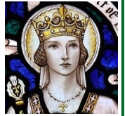
St Margaret of Scotland