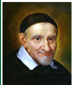
St Vincent De Paul